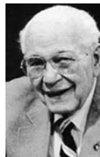
Leo Fender, grew up here.