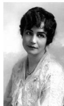
Lois Weber, America's first woman filmmaker lived in Fullerton.