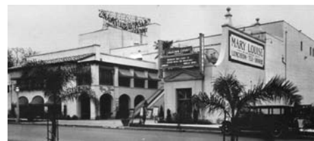
Fox Fullerton Theater

Fullerton Ghosts is filled to the brim with