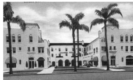
The California Hotel (now Villa del Sol)

a unique historical blend of business and industry, parks and recreation, oil and agriculture, homes and mansions, libraries, schools and churches. The celebrations and special events that have taken place here since the 1880s are an integral part Fullerton's heritage. This special link to the past is on full display in the numerous protected and preserved historic buildings that dot the local landscape. In Fullerton, the present and past continually cross paths. The city conjures up nostalgic reminiscences of a bygone era. It also conjures up GHOSTS!